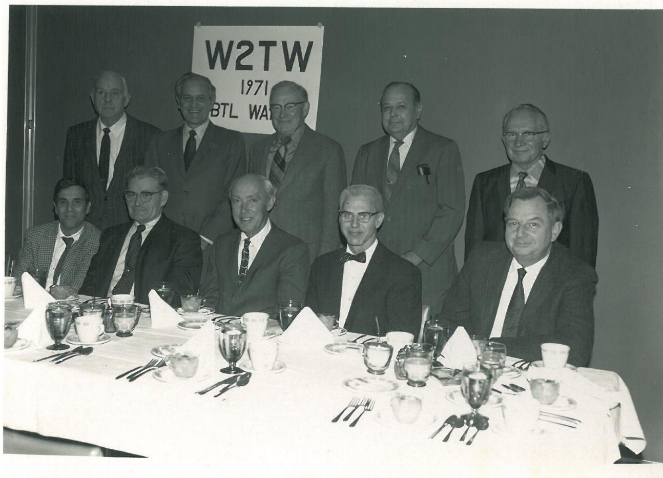
How many Charter Members can you find in this picture? Find out at the January Meeting

There was no business meeting in December. A Holiday Get-Together was held at the East Hanover Diner on December 16. Ten members and one guest were in attendance.