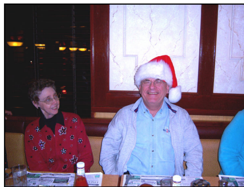
At least someone got in the holiday spirit.