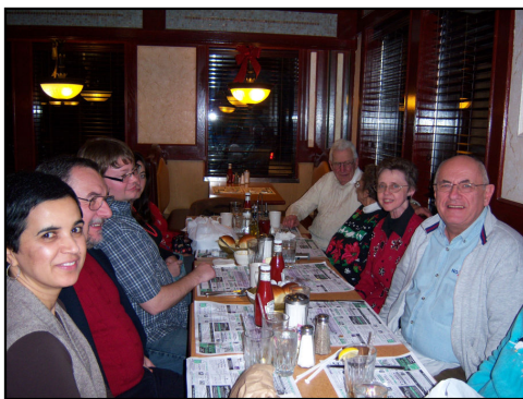
Talking about Field Day while waiting for desert.

There was no business meeting in December. A Holiday Get-Together was held at the Brookside Diner in Whippany on December 19.