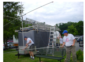
Hanover really should have consulted us before putting in this bench.