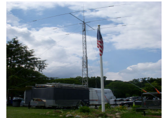
Ready to heat up the ether.