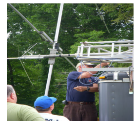
Which way does this rope go?