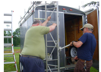
Are you sure this is the crank?

September 19, 2011 Regular business meeting